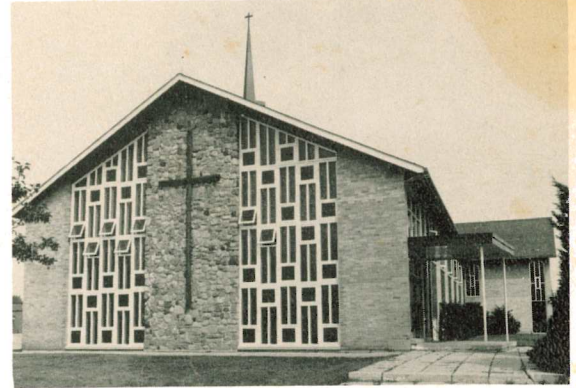
St. Ambrose Church