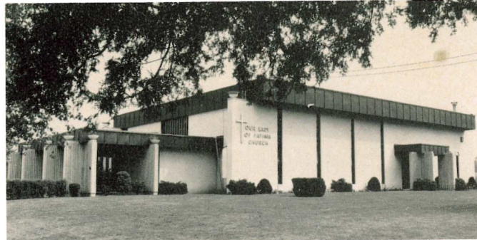
Our Lady of Fatima Church