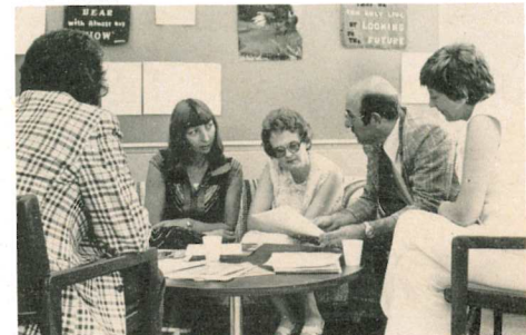
Conferring with parents